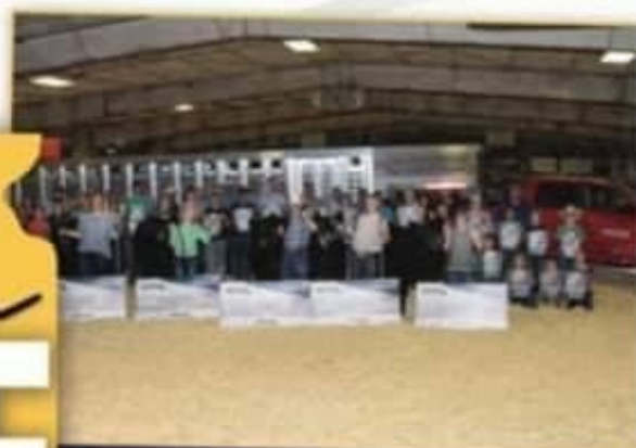
TOP 5 MARKET ANIMALS 2020 SOUTH DAKOTA STATE FAIR 4-H SHOW