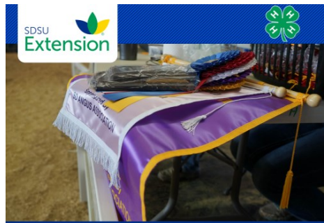
2021 SDSU Extension 4-H State Fair Book

THE 2021 STATE FAIR BOOK HAS BEEN PUBLISHED. AND ALL YOUTH IN ACTION PACKETS HAVE BEEN UPDATED. YOU CAN FIND IT ON THE SDSU EXTENSION WEBSITE OR ON OUR CLAY COUNTY 4-H WEBSITE AS WELL. CLICK ON THE COVER FOR THE LINK.